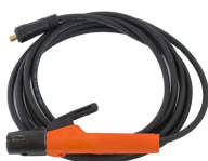
Welding cable 5 m 16 mm 2