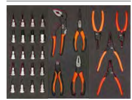
FF1E2209 FF1E4001 FF1E4002