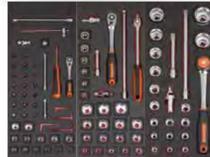
FF1E2002 FF1E2103 FF1E2203