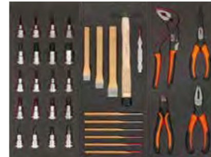
FF1E2209 FF1E5002 FF1E4001