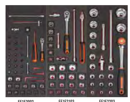
FF1E2002 FF1E2103 FF1E2203